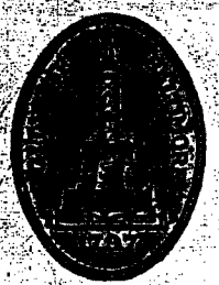
KURT L. SCHMOKE Mayor